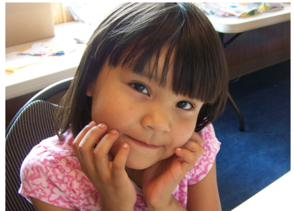
One of the First Nation children that participated in the 2010 LAMP VBS program.